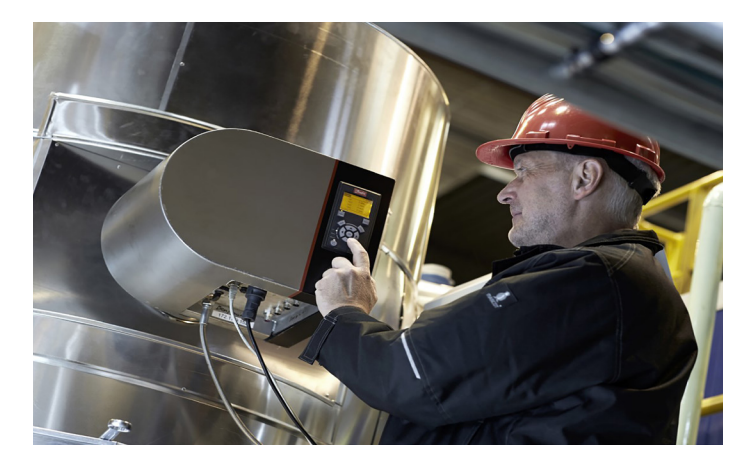
Figure 1. An Ocean Insight Maya2000 Pro spectrometer assembly has been integrated into a maritime emissions sensor for use at sea.

Ocean Insight partnered with Denmark-based Danfoss IXA to develop extremely robust sensor systems for the maritime environment. We customized the spectrometer assembly to withstand the high temperatures and vibration conditions experienced on cargo ships and in exhaust stacks (Figure 1).