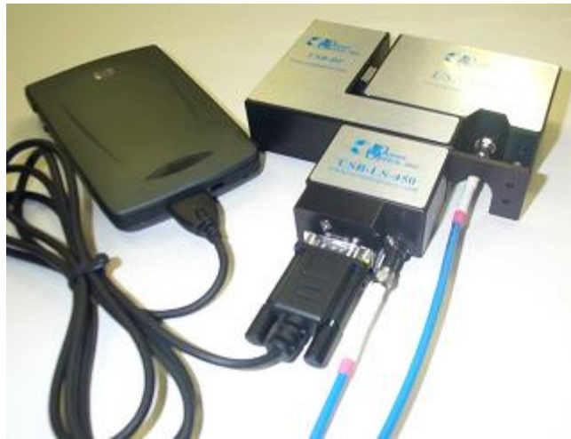
Figure 4: Assembled USB2000, USB-BP Battery Pack, LS-450 Light Source, and Handheld PC

The Jornada handheld PC does not use the USB-BP for power. The Jornada handheld PC can either run from its batteries or it must be plugged into a power source.