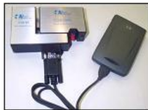
Figure 3: Assembled USB2000, USB-BP Battery Pack, and Handheld PC