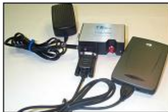
Figure 2: USB2000 Spectrometer Connected to a Handheld PC