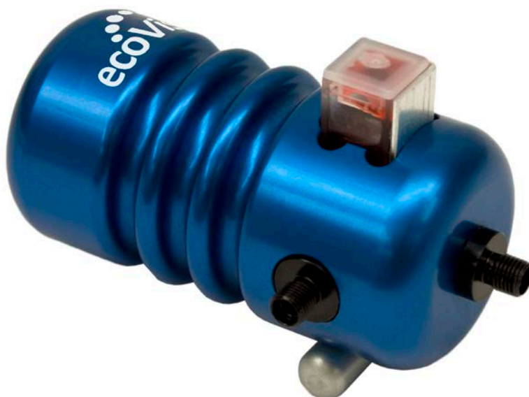
ecoVis Light Source

EcoVis is designed for absorbance and fluorescence of cuvette-based samples. Its rugged housing and simple design make it useful for teaching labs and setups where basic absorbance and fluorescence measurements are performed routinely.