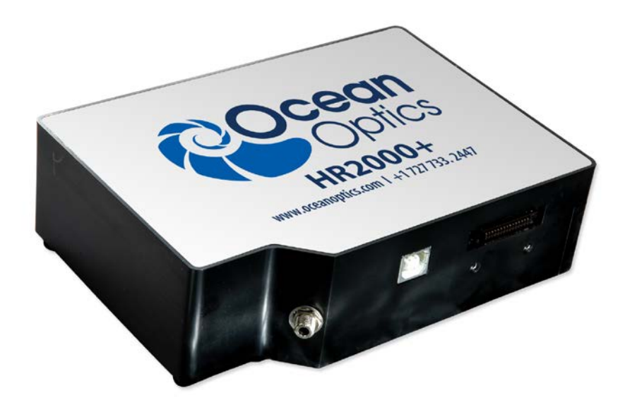
Ocean Optics HR2000+ High-speed Fiber Optic Spectrometer

The HR2000+ Spectrometer connects to a notebook or desktop PC via USB port or serial port. When connected to the USB port of a PC, the HR2000+ draws power from the host PC, eliminating the need for an external power supply. The HR2000+, like all our USB devices, can be controlled by our OceanView software, a Java-based spectroscopy software platform that operates on Windows, Macintosh and Linux operating systems.