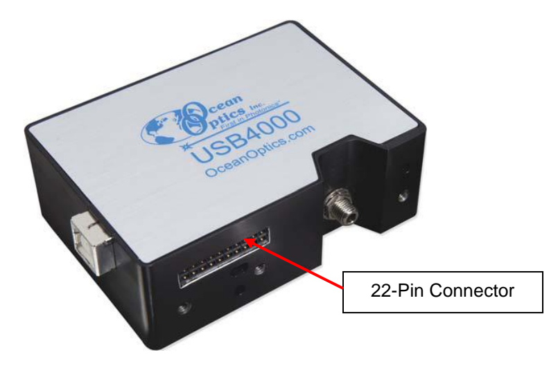
Location of USB4000 22-Pin Accessory Connector

The USB4000 features a 22-pin Accessory Connector, located on the front of the unit as shown: