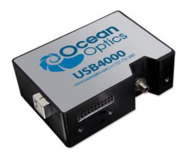
Ocean Optics USB4000 Fiber Optic Spectrometer

The USB4000 Spectrometer connects to a computer via the USB port or serial port. When connected through a USB 2.0 or 1.1, the spectrometer draws power from the host computer, eliminating the need for an external power supply. The USB4000, like all our USB devices, can be controlled by our OceanView software, a Java-based spectroscopy software platform that operates on Windows, Macintosh and Linux operating systems.